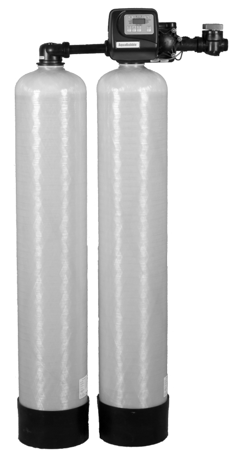
Brine tank included (not pictured)